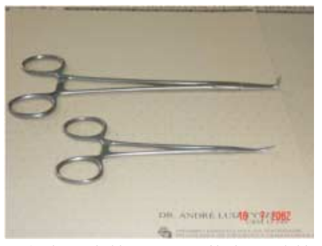
Fig. 1 – Photograph of the instruments used for the removal of the atherosclerotic plaque.

the first. In one patient there was a need to immediately review the endarterectomy and the anastomosis of the left internal thoracic artery to the anterior interventricular branch had to be redone.