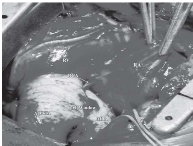
Fig. 1 – Intraoperative photograph showing D-Transposition of great arteries with an aortopulmonary window before surgical repair. Aorta was found to be anterior to the pulmonary artery with a large aortopulmonary window between them RV – Right ventricle, RA – Right atrium, MPA – Main pulmonary artery, RCA – Right coronary artery, AP Window - Aortopulmonary window

Under cardiopulmonary bypass and moderate hypothermia, patent arterial duct was dissected, transected and divided, branch pulmonary arteries were snugged and occluded to avoid steal from systemic circulation and flooding of the pulmonary circulation through the aortopulmonary window. After clamping the aorta, with the pulmonary arteries still occluded, cold blood cardioplegia was given into the aortic root. ventricular septal defects were closed using expanded polytetrafluoroethylene patch through right atrial approach. The great arteries were dissected free and the aortopulmonary window was located. The great arteries were transected at the level of the aortopulmonary window (Figure 2A), which was included