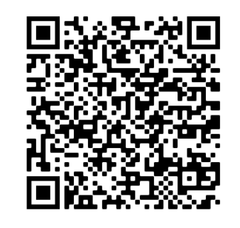
Video 1 - French Cuff technique, to ensure proximal annular hemostasis.

The reason we prefer central cannulation in most cases is that peripheral cannulation is also a rather invasive procedure. We used the right axillary artery for cannulation since we performed