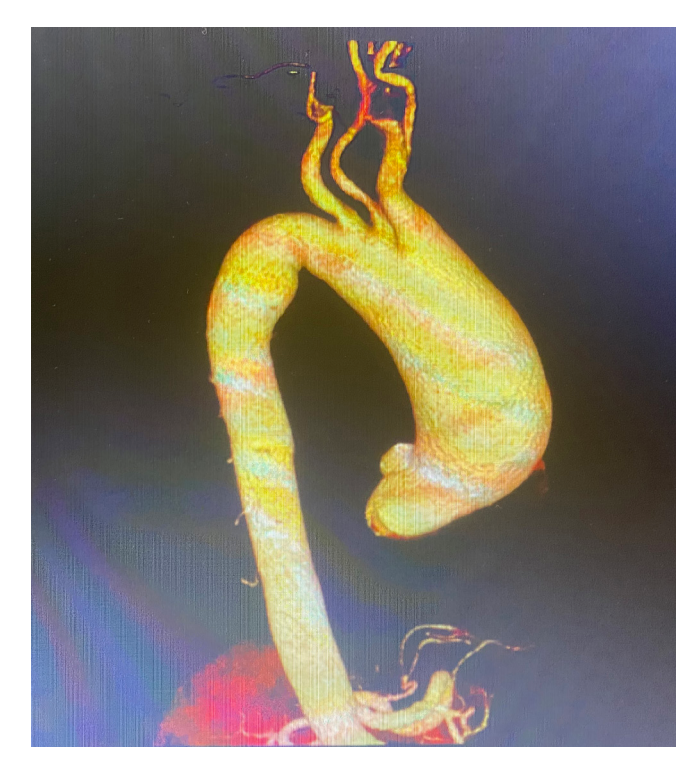
Fig. 1 - Preoperative 3D computed tomography image of a patient with ascending and aortic arch aneurysm.

site marking was performed with a marker. We made a skin incision starting at the sternal angle and extending to the 3<sup>rd</sup> or 4<sup>th</sup> intercostal space. We applied upper J-shaped ministernotomy through the 3<sup>rd</sup> or 4<sup>th</sup> intercostal space according to the location of the ascending aorta on contrast-enhanced CT.