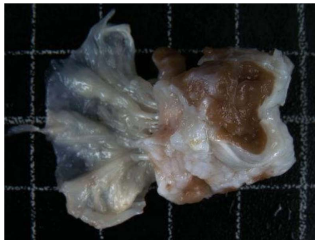
Fig. 4 - A thickened tricuspid valve leaflet of heterogeneous thickness, with thickened and retracted chordae tendineae.