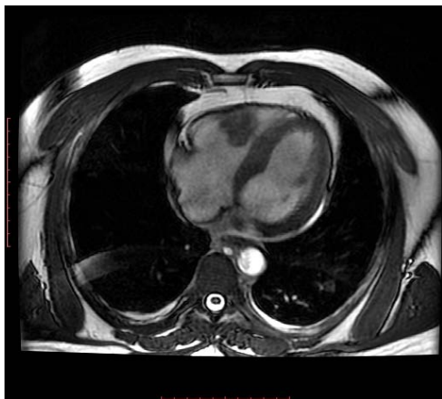
Fig. 2 - Steady-state free precession four-chamber cine view of cardiac magnetic resonance imaging demonstrating an apical obliteration of the right ventricle with a mass-like appearance protruding into the cavity from the right ventricular free wall. Note the pericardial effusion.

Next, the right ventricle approach was made via an arciform transversal opening of the right atrium. At the inspection, we found a retraction of the right-sided chambers and a lack of mobility of the anterior and the posterior leaflets of the tricuspid valve. This retraction made the examination difficult of the ventricular cavity. In the view of this finding, the tricuspid valve considered being not repairable, and we decided to replace it with a bioprosthesis valve after the excision of the mass. As the resection of this valve was made, we found a mass in the right ventricle cavity that is subendocardial, indurate, smooth, yellowish and lobulated, invading the anterior papillary muscle, which caused the retraction of both the anterior and posterior leaflets. We should affirm that the posterior limit of this pathological tissue was invisible and difficult to be visualized.