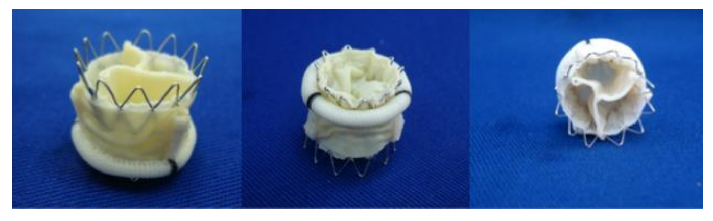
Fig. 3 - Image showing the structure composed by the overlapping of a conventional prosthesis (27 mm) and a transcatheter prosthesis (26 mm).

The choice of nominal sizes 1 mm above and below the nominal size of the bioprosthesis was the result of considerations between the internal diameter of the bioprosthesis and the external diameter of the transcatheter valve, which, because it is an expandable balloon, requires oversizing. Analyzing these diameters, it was observed that, requiring a radial force for anchoring the transcatheter valve, an oversize of 10% to 20% of the transcatheter prostheses was chosen in relation to the bioprosthesis (Table 3). Thus, the sets of tests were as mentioned in the previous paragraph.