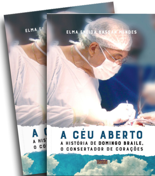
The book cover of his biography.