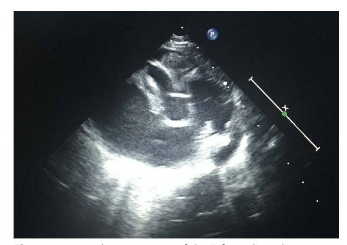
Fig. 2 - A transthoracic image of CAVF from the right coronary artery to right atrium.

Multiple fistulas may be present in 11% to 16% of patients, and fistulas might originate from two separate coronary arteries