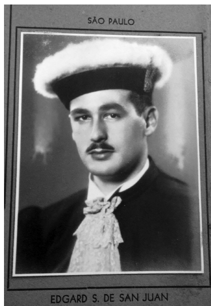
Fig. 2 - Graduating from the University of São Paulo Medical School in 1944.

He became professor of Clinical Surgery at the University of São Paulo Medical School in 1954, presenting a thesis on "The Surgical Treatment of Congenital Lung Cysts".