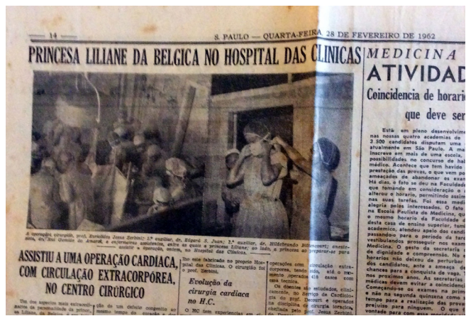
Fig. 8 - Princess Lilian of Belgium visiting the Hospital das Clínicas (Clinical Hospital) – FMUSP.

He was also devoted to his family in his little free time, sometimes as a very understanding father and friend for all times, or as wise and experienced counselor of his five children (Figure 9).