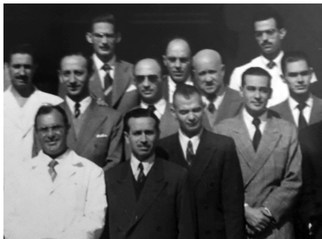
Fig. 3 - Thoracic Group - First Surgical Clinic (FMUSP).

He was a disciple of Professor Zerbini in the early fifties and member of the "Thoracic Group" (Grupo de Tórax) of the first surgical clinic, accompanying him on surgical procedures at Santa Casa de Misericórdia de São Paulo and at the new Clinical Hospital (Hospital das Clínicas), recently opened in São Paulo (Figure 3). He stood out in lung, pleural, mediastinal surgery, and also in the surgical treatment of tuberculosis.