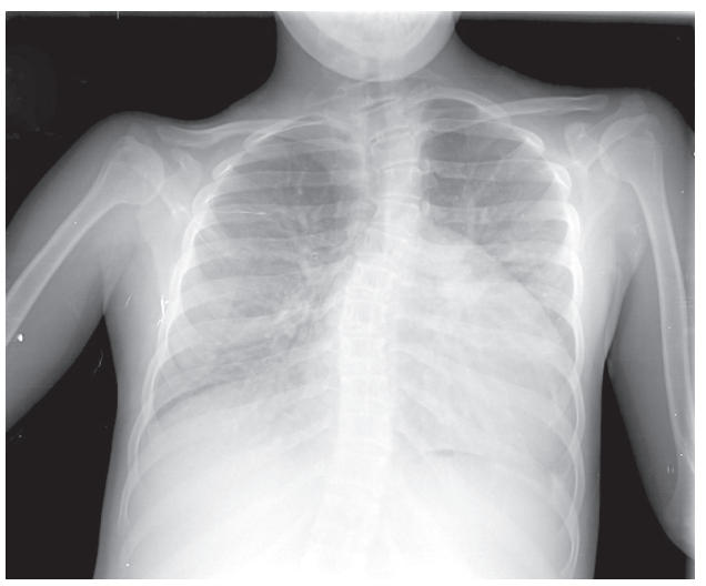
Fig. 2 – Chest roentgenography showing the increase of cardiac area and pulmonary hyperflow signs

conventional way. Cardiopulmonary bypass and myocardial ischemia times were 25 minutes and 11 minutes, respectively. Hypothyroidism control was done postoperatively and the echocardiogram showed the following: subtle mitral regurgitation without hemodynamic repercussion; preserved myocardial contractility; and normal ejection fraction. Patient was discharge at postoperative day 6 using diuretic agent and thyroxine sodium.