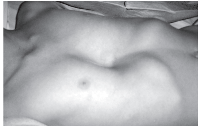
Fig. 1 – Pectus excavatum-type deformity

At the end of the operation (Figure 5), the patient in normothermia was referred to the postoperative unit, where he was continuously monitored.