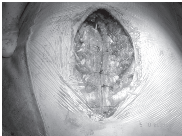
Fig. 4 – Parallel fixation of the fractured sternum in the depressed point after the resection of the costal arches