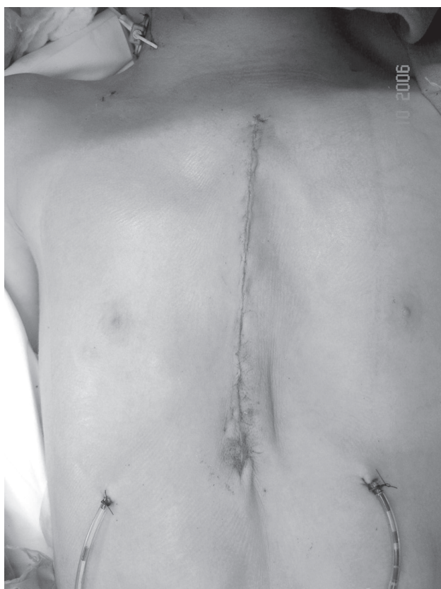
Fig. 5 – Final aspect