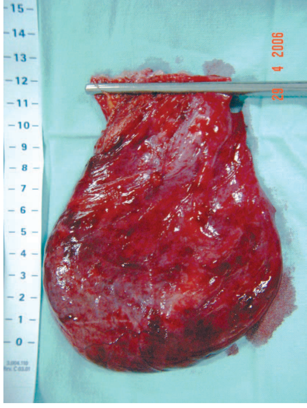
Fig. 2 – Macroscopic appearance of a giant pericardial cyst