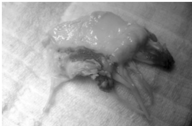
Fig. 1 – Anterior cuspid of the mitral valve with vegetation

On January 17 2003 surgery was performed using median sternotomy, cardiopulmonary bypass, and moderate hypothermia. The ascending aorta and both vena cavae were cannulated and myocardial protection was achieved with normothermic antegrade sanguineous cardioplegia repeated at twenty-minute intervals. After left atriotomy, the insufficient mitral valve was exposed with the anterior cuspid ruptured and with vegetation of 2 x 2 cm (Figure 1).